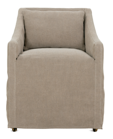
Shown in fabric 20337-57.

Odessa-SLIP-502 Dining Arm Chair with Casters L26" D27" H33"