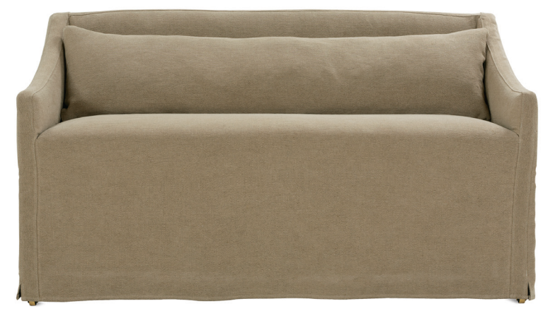
Shown in fabric 15061-86.

Odessa-SLIP-520 Dining Banquette with Casters L59" D27" H33"