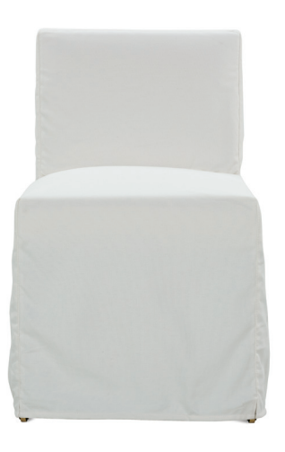
Shown in fabric 15161-43.

Seat Height 21" Seat Depth 15" Arm Height 25" Width Between Arms 20"