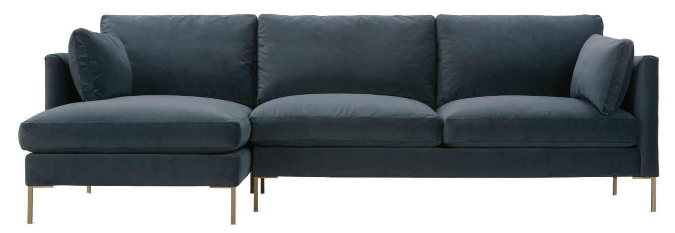
Shown in fabric 17799-66, bolster pillows in fabric 17799-66. Burnished brass metal leg finish. (Shown above: Holloway-110 and Holloway-115)

Holloway-110/111 Chaise - RSC/LSC L37" D65" H38"